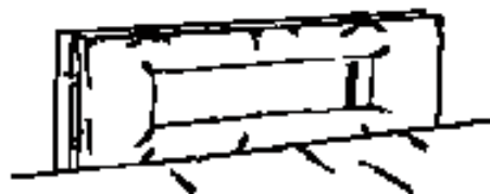
NEW Full-View Bed Rail Pads.